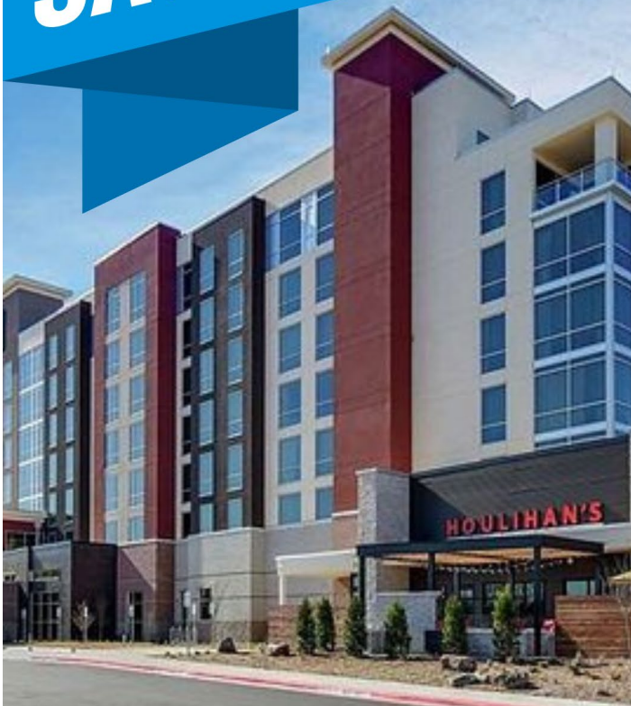
Embassy Suites by Hilton Jonesboro Red Wolf Convention Center