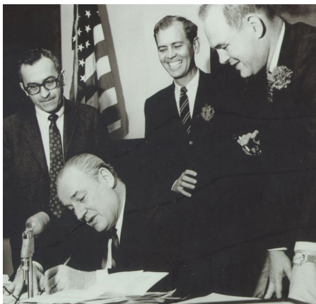
Gov. Winthrop Rockefeller signing the Arkansas Freedom of Information Act into law on February 14, 1967.

If the body persists, the reporter should notify his or her supervisor immediately, and the citizen should contact the prosecuting attorney.